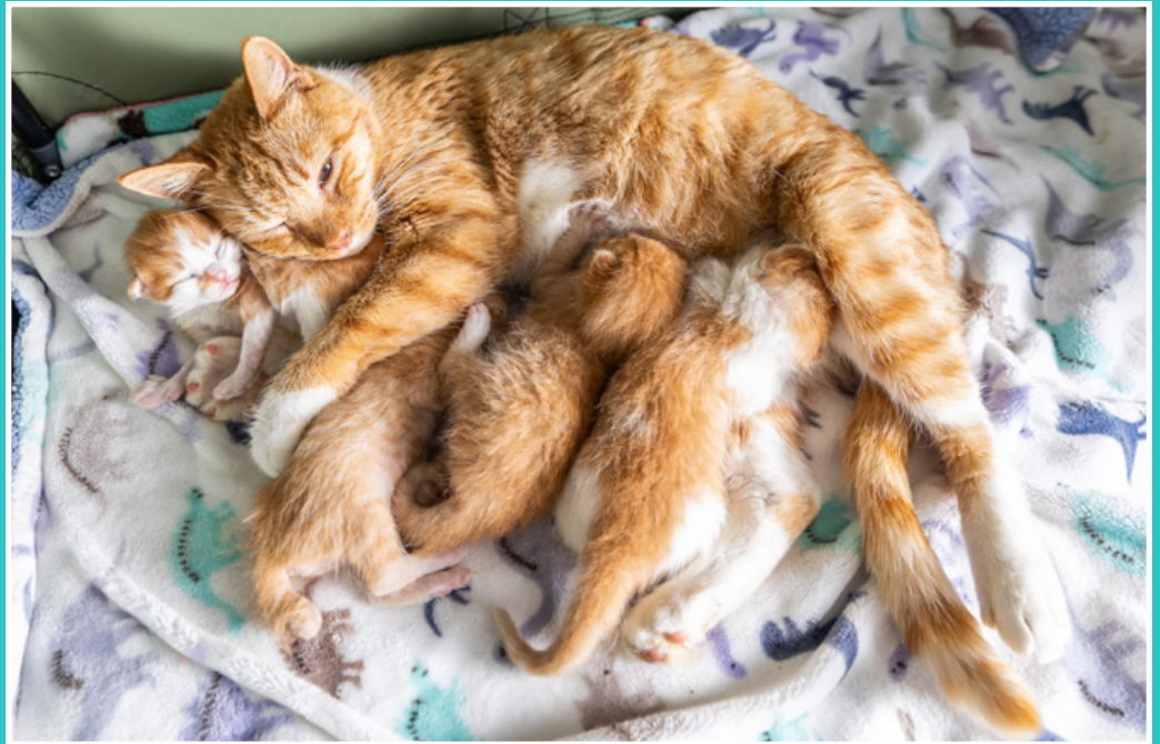
Mama Firework and her ginger kittens!