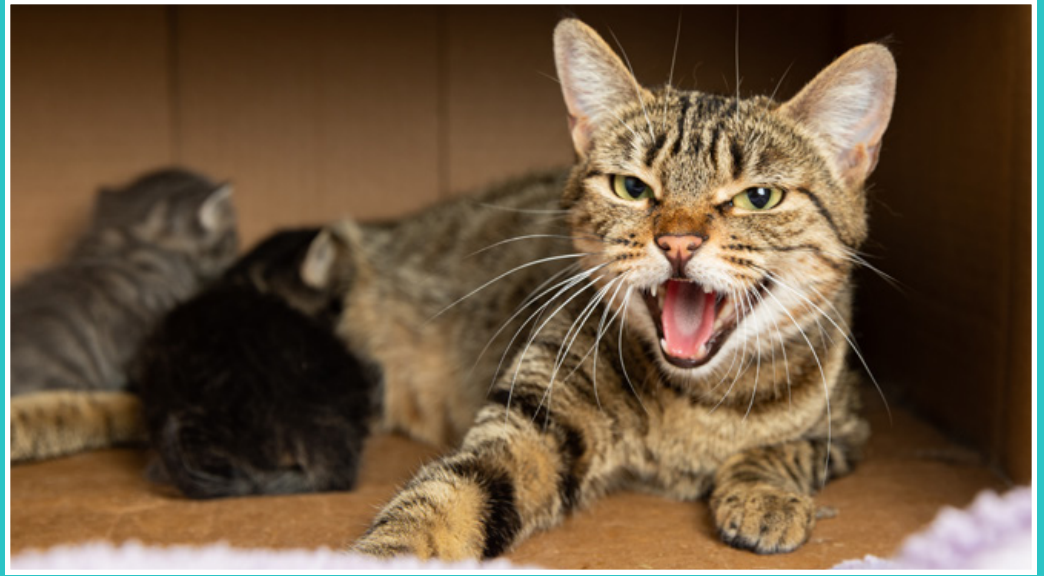
Mama Angel Kitty may not love humans...but she adored her babies!