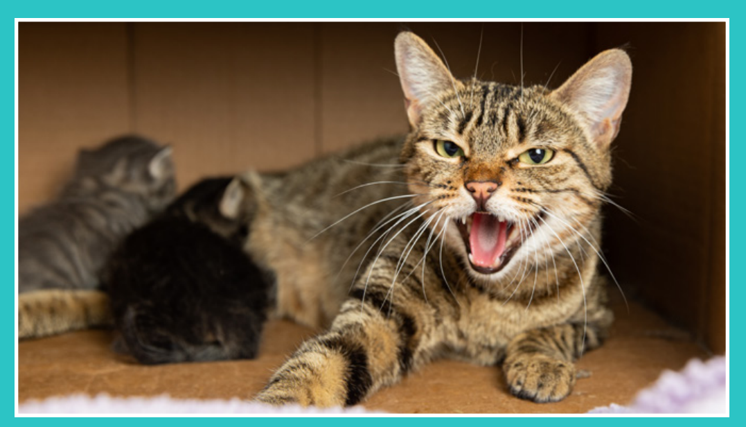
Mama Angel Kitty may not love humans...but she adored her babies!